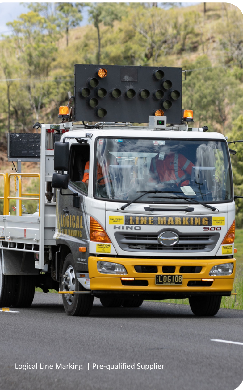
Logical Line Marking | Pre-qualified Supplier

A Local Buy Pre-qualified Supplier refers to a company that Local Buy has thoroughly evaluated and deemed to possess the essential technical, financial, and managerial expertise required to deliver services or provide goods in accordance with specific standards. Once your company is appointed as a Local Buy Pre-qualified Supplier, it becomes visible to councils searching for the products and services offered through that arrangement.