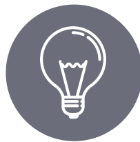
LAMPS & LIGHTING